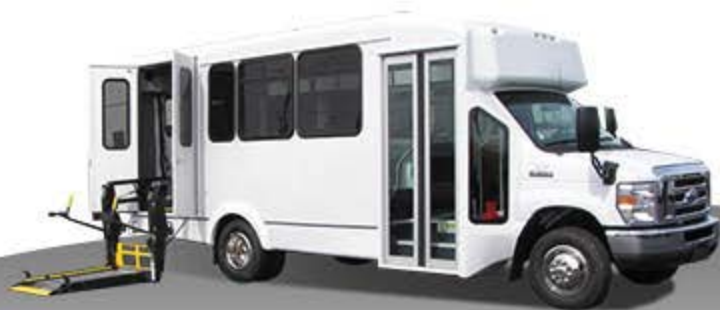
12 Passenger + 2 Wheelchair Shuttle