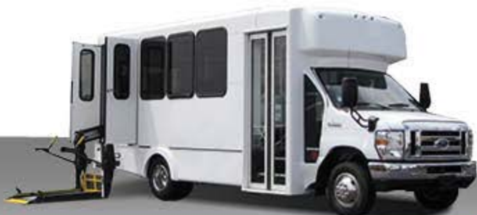
8 Passenger + 4 Wheelchair Shuttle