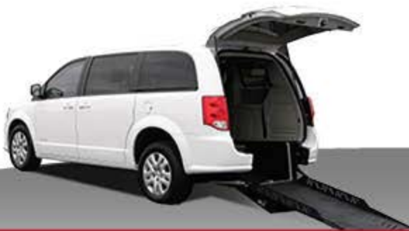
Dodge Grand Caravan