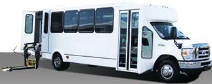
20 Passenger + 2 Wheelchair Shuttle