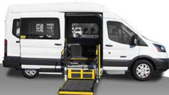
Ford Transit Side Entry