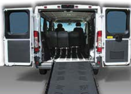
Dodge ProMaster Rear Entry Full Sized Van