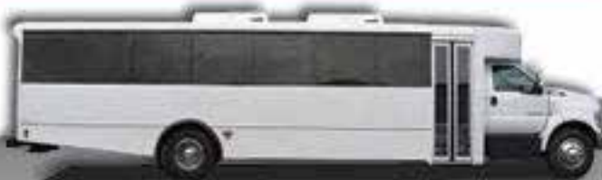
35 Passenger Shuttles