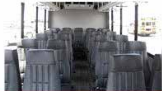
25 Passenger Shuttles