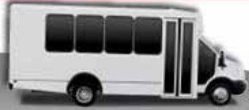
15 Passenger Shuttles