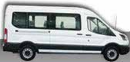
Ford Transit Vans