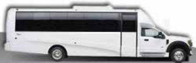
28-32 Passenger Shuttles