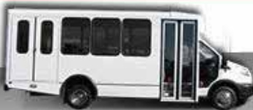
12 Passenger + 2 Wheelchair Shuttles