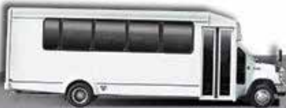
25 Passenger Shuttles