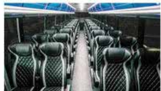
38 Passenger Shuttles