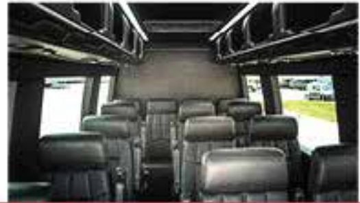
Mercedes Benz Sprinters