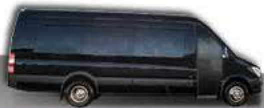
Mercedes Benz Sprinters