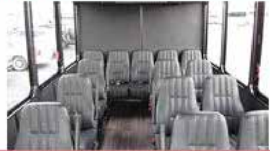
15 Passenger Shuttles