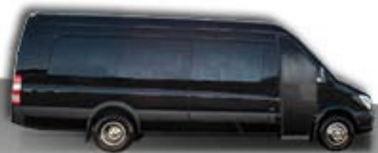
Mercedes Benz Sprinters