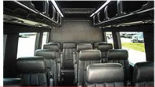
Mercedes Benz Sprinters