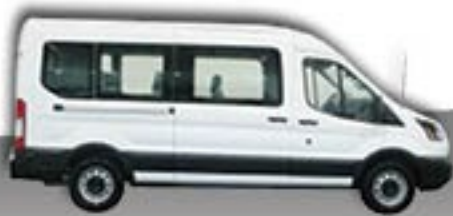
Ford Transit Vans