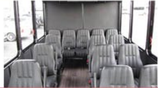
15 Passenger Shuttles