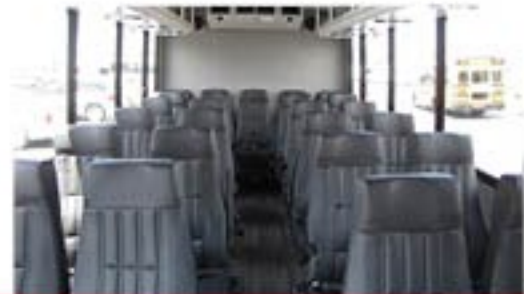
25 Passenger Shuttles