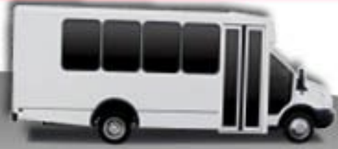
15 Passenger Shuttles