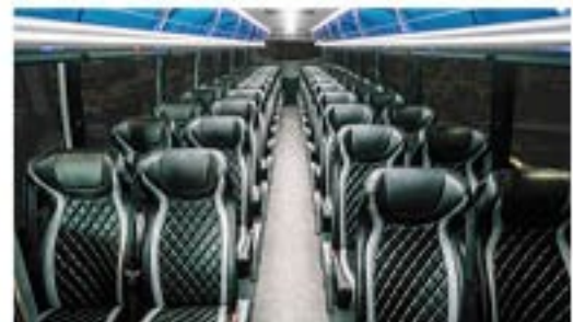
38 Passenger Shuttles