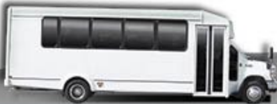
25 Passenger Shuttles