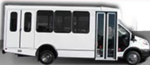
12 Passenger + 2 Wheelchair Shuttles