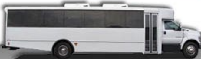
35 Passenger Shuttles