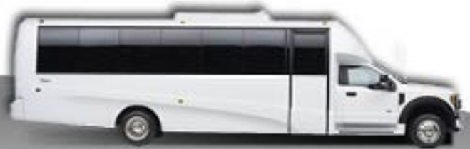
28-32 Passenger Shuttles