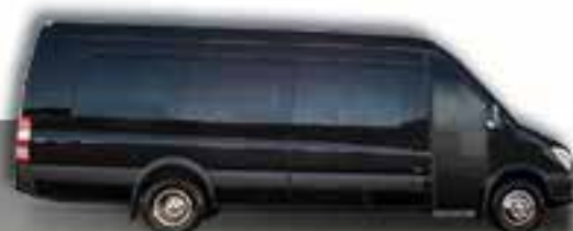
Mercedes Benz Sprinters