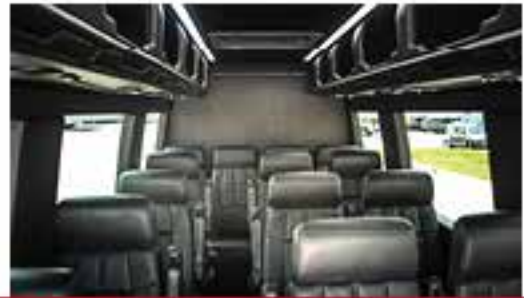
Mercedes Benz Sprinters