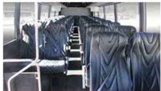
38 Passenger Shuttles