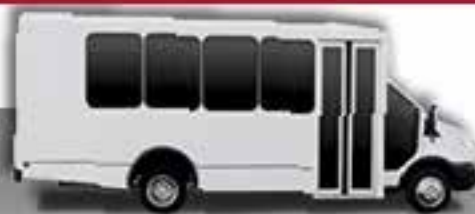
15 Passenger Shuttles