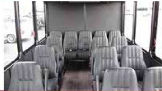
15 Passenger Shuttles