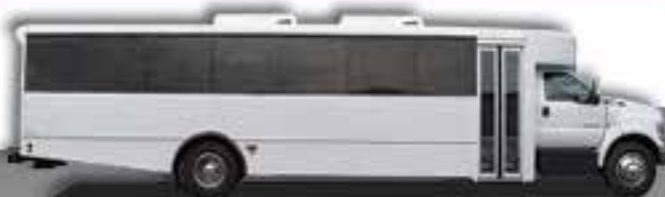
35 Passenger Shuttles