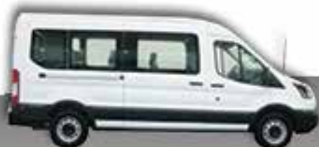
Ford Transit Vans