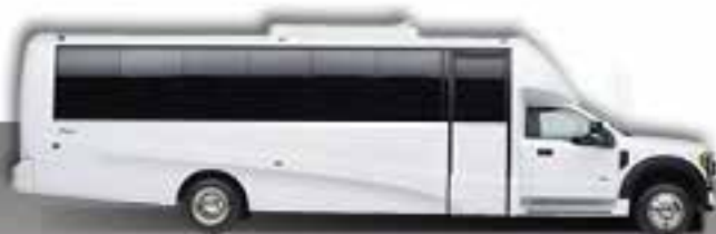
27-31 Passenger Shuttles