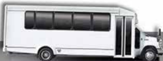
25 Passenger Shuttles