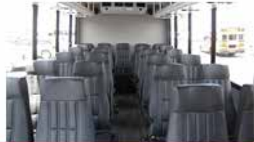
25 Passenger Shuttles