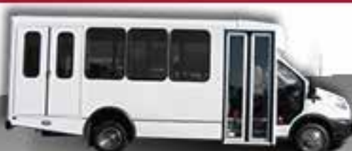
12 Passenger + 2 Wheelchair Shuttles